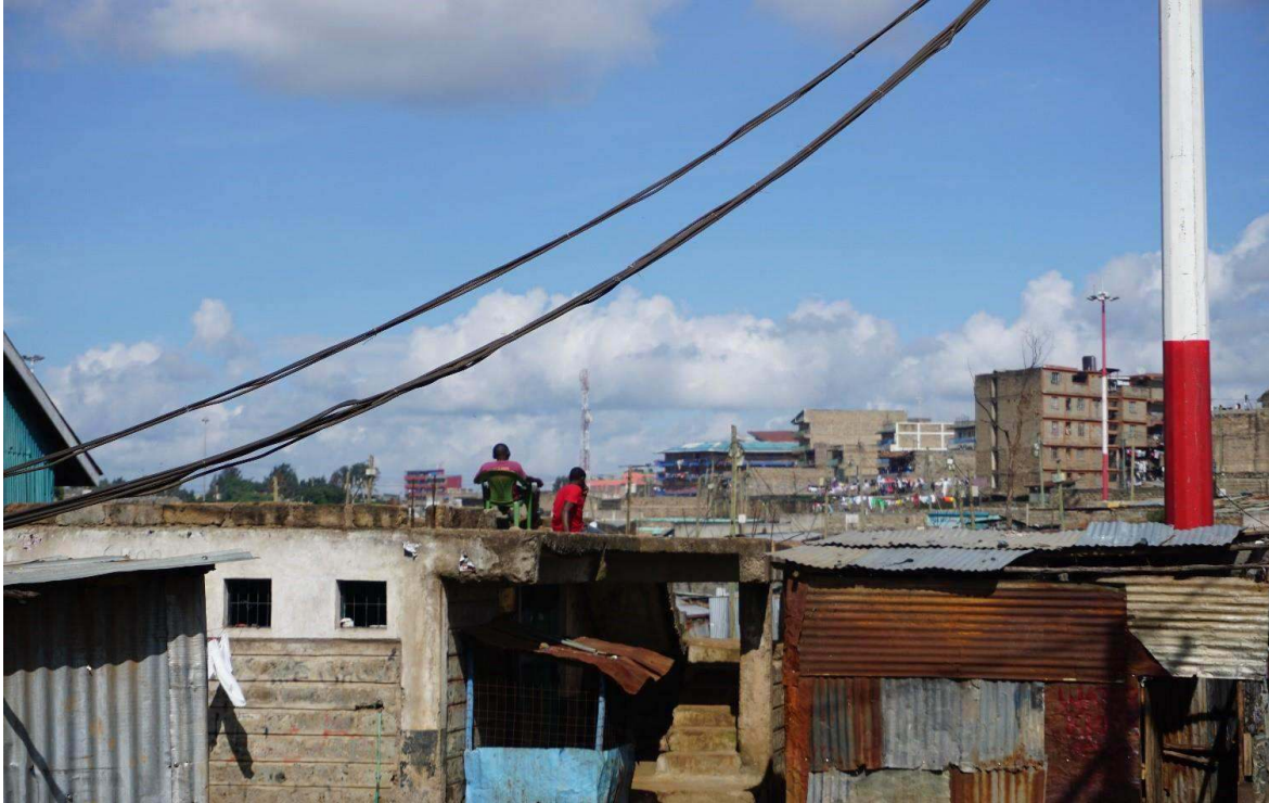
Figure 14: Members of Mzinduko sit on top of their office

Their overall belief for the project is that it will be good for the community, using quite a developmentalist discourse to back it up. As well as the roads that will improve accessibility in Korogocho, this group hoped that the provision of new housing will make it a more visited area of the city with more affluent residents of Nairobi wanting to do business here and bring opportunities (Mzinduko, Interview, 2018). The treasurer of their group had been placed in a plot with three others, but did believe that accessing a loan would not be too difficult or impose too many constraints (Mzinduko, Interview, 2018). There were tenants in their group, who had not been given plot titles. They did see their future in Korogocho however, and hoped that new business opportunities that would come with the slum upgrading program would compensate for the increased rent they would have to pay (Mzinduko, Interview, 2018).