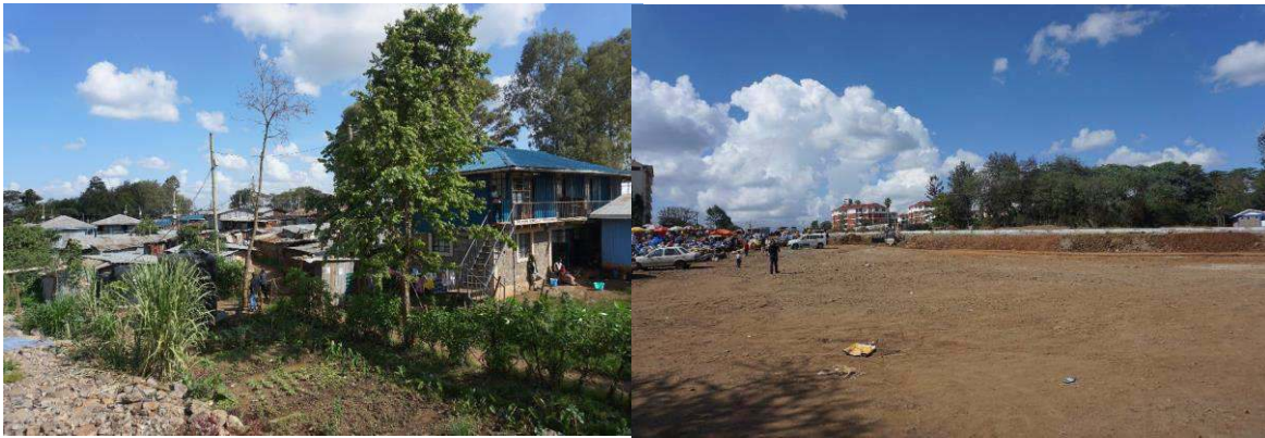
Figure 11: The beginning of the road (right) and the area to be demolished (left)

desired alternative futures 35 , which would have not been possible if the project had run without hinderances.