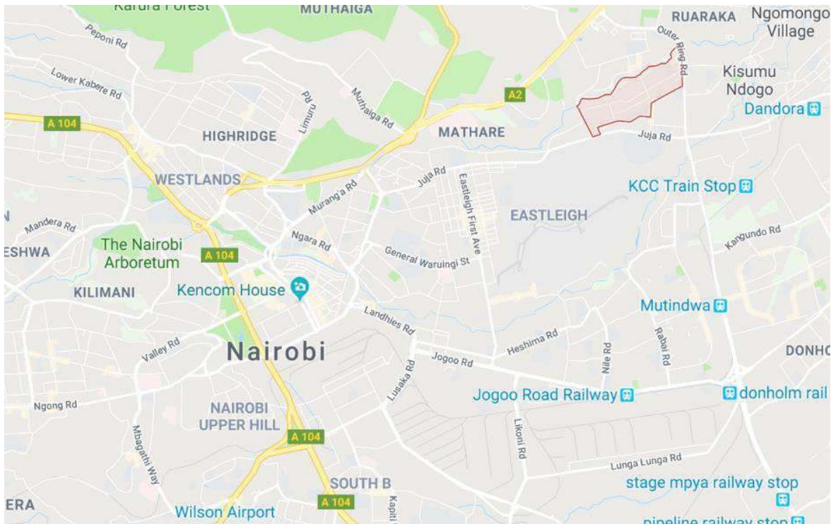
Figure 4: Huruma Location (google maps)

as is the case in Korogocho, and relatively few tensions between structure owners and tenants (Alam et al, 23).