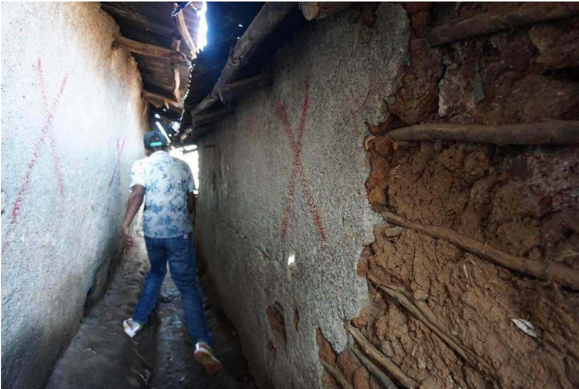
Figure 12: Plots to be Demolished in Korogocho

change matters. Some are even told that because they are connected in some way to the RC they only have to share their plot with three others instead of 5 others, and that they should consider themselves fortunate (Ndungu, Interview, 2018). Redistributing the benefits of slum upgrading in Korogocho is about one's ties to the RC. Korogocho reveals that "successful" implementation of slum upgrading projects is not only a case of patronage ties between participatory bodies and local government, as Zérah mentions, but also between local inhabitants and participatory bodies. The redistribution of project welfare in Korogocho has a different way of manifesting itself than in Kibera, yet is only an option when the individual is well connected.