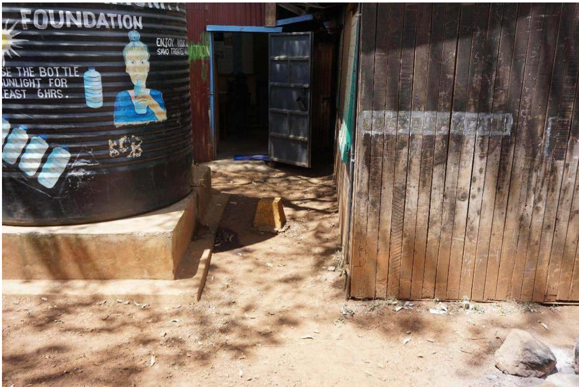
Figure 10: A yellow marker placed in the Amani Kibera compound