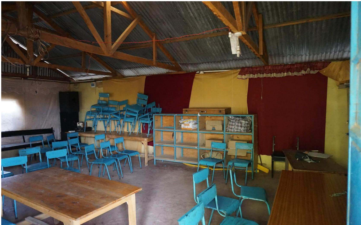
Figure 5: The Kamar Ghema Network meeting hall

Much like in Korogocho the structure of the Muunganos resemble the RCs. In each village we find a Muungano made up of a chairman, a treasurer and a secretary. These positions are voted in by acclamation during public gatherings. These individual Muungano representatives form part of a larger network, Kamar Ghema 22 .