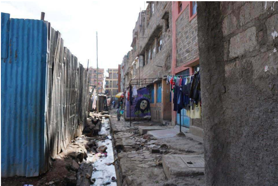
Figure 13: A completed street in Mahera, facing slums.

would be untrue to state that there is a good level of understanding between those running the Muungano projects and those resisting. But symbolically there is value in rendering people aware of discontent through resisting. There are also further repercussions, as the government is aware of the project failures in Huruma, making it difficult for villages to negotiate for community land titles with the NCC (Mbutia, Interview, 2018). Therefore, at the Muungano administrative level and the City County level, there is a clear understanding that on the ground level there are serious failures. Looking back at the original question of this report, resistance yet again is a more effective way to channel discontent and project failures than participatory bodies. Once more, the requirements for a CBO or participatory bodies to function according to government or International NGO standards are very high and out of reach for most citizens (Dill, 737). In Huruma, individual resistance or a set of collective actions has a lot of symbolic and intangible effect, as it is the means of communication for the more marginalized communities.