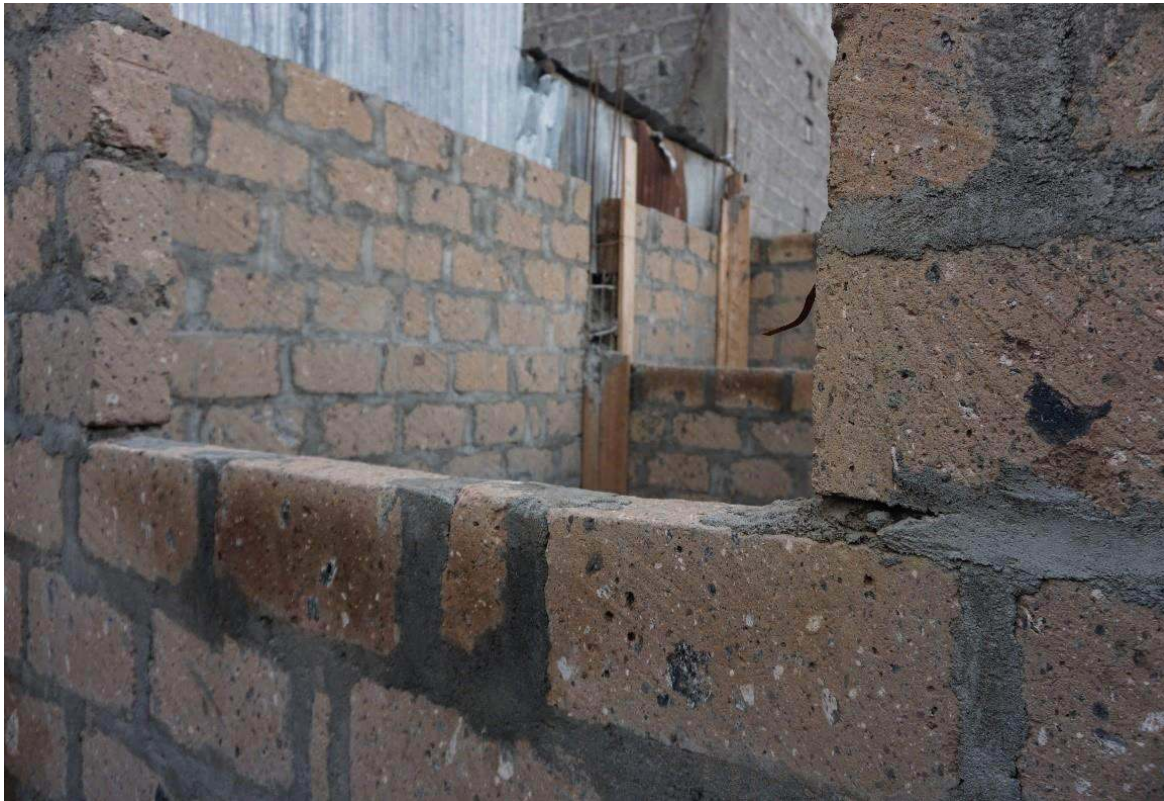
Figure 9: The construction of a plot of land sold to an independent investor

What is behind the successful resistance in Redeemed is the unlikely and implicit relationship between slaughter houses and inhabitants.