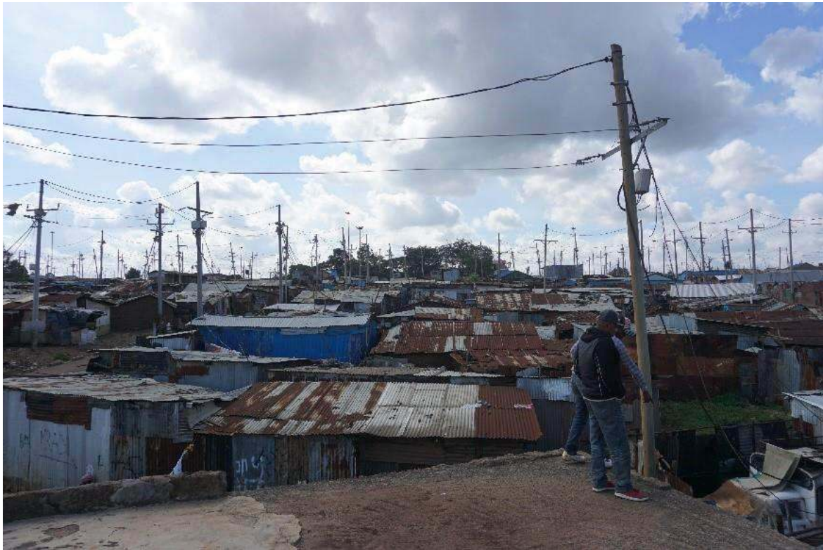
Figure 3: Different homes to be upgraded in Korogocho A

600,000 shillings each (KSUP, Interview, 2018) Secondly, the pressure from the local inhabitants, meant that the government was coerced into accepting individual land titles.