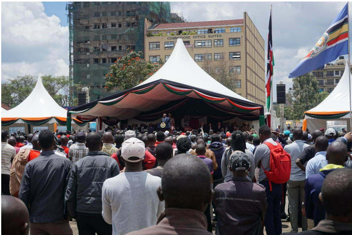
Figure 7: President Uhuru Kenyatta opening Ngong road phase 2, around the corner from the Kibera-Langata road

From KURA's perspective, the major challenge is how to negotiate or engage with the communities that will be affected. It is therefore highly unlikely that the road will be completed within the next year and a half. KURA views the people living in Kibera as being illegal settlers, and therefore sees it within its right to evict these people out of their homes, with little or no compensation 26 .