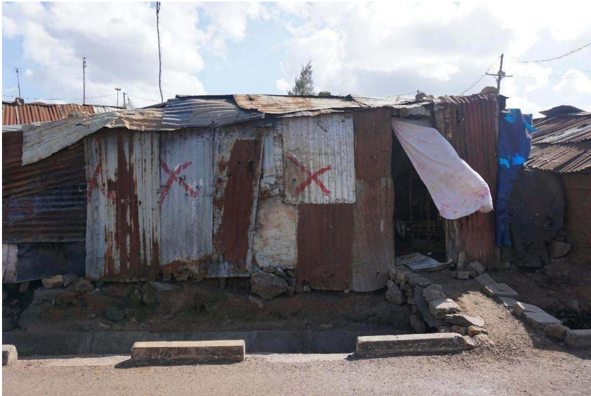
Figure 8: Houses marked for demolition to make way for the access

needs, community members will then go to the displacement by the RC. This request has never been met. As explained above, in the absence RC and hold personal talks in attempt to get their demands met.