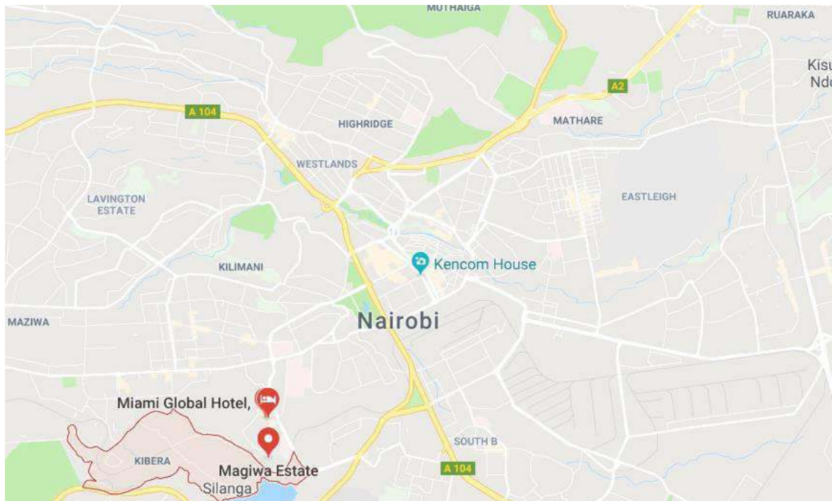
Figure 6: Kibera Location (google maps)

As the title of this subsection indicates, this project is not exactly a slum upgrading project, or at least not framed as one. However, this report will take this as a form of slum upgrading. Roads are an essential part to the slum upgrading projects as are other urban transit amenities. Furthermore, the implementing institution, Kenyan Urban Roads Authority (KURA), defends the project with a highly developmentalist discourse. It promises drainage along the road will improve, businesses will be able to thrive and services can be delivered (KURA, Interview, 2018).